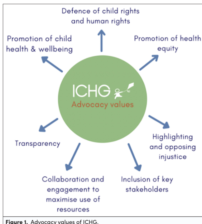
Figure 1. Advocacy values of ICHG.