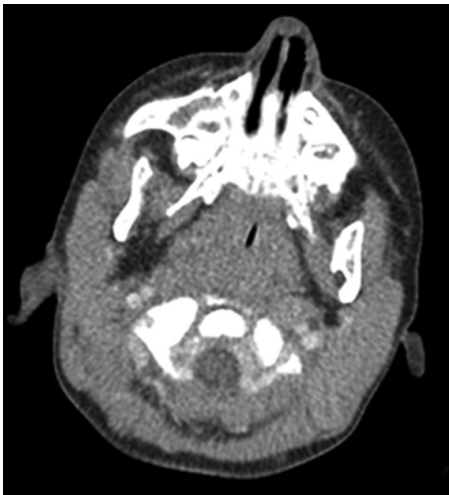
Figure 1. Obliterated air column due to adenoid hypertrophy in the neck

The respiration became superficial a short time after presentation and methylprednisolone at a dose of 1 mg/kg/dose every 6 hours was administered; the patient was intubated and connected to mechanical ventilator. Thoracic and cervical computerized tomography revealed multiple lymphadenopathy, adenoid hypertrophy, obliterated respiratory airway and bilateral extensive consolidation areas; no abscess formation or foreign body was observed (Figure 1, 2). In laboratory investigations, leukocytosis (16,000/mm 3 ) was found. Total immunoglobulin G, M and A levels were found to be normal. Throat culture remained negative. Ceftriaxone (80 mg/kg/day) was started because of presence of consolidation areas, poor general status and leukocytosis. The patient was monitored in the intubated state for 48 hours. When the general status improved, the patient was extubated and his treatment was continued.