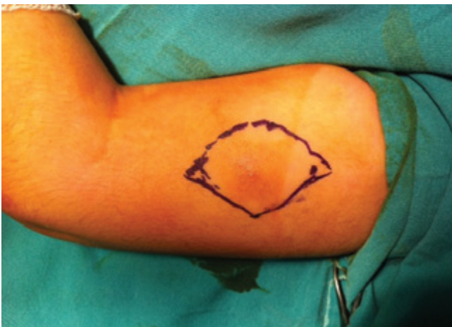
Figure 1. Preoperative appearance of the mass in the distal \frac{1}{2} lateral part of the left arm